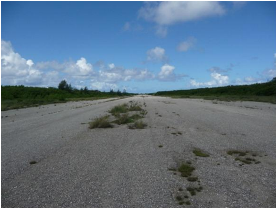
Runway Able - Today