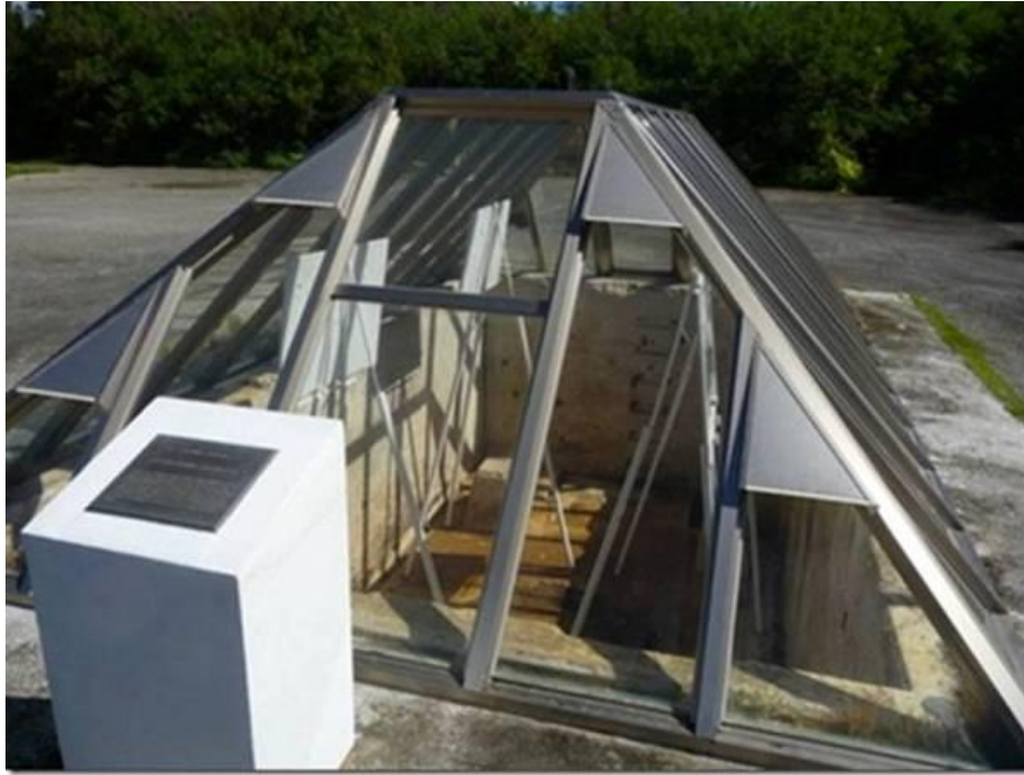
Atomic Bomb Pit #1 – Where "Little Boy" was loaded on the Enola Gay