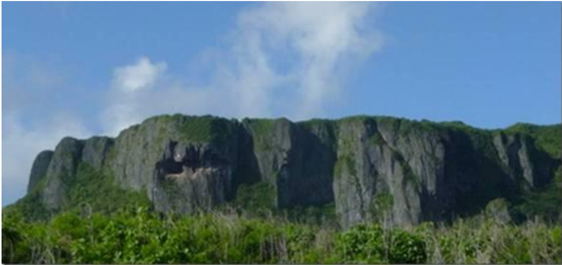
Banzai Cliff – where civilians were ordered to commit suicide rather than surrender to US troops