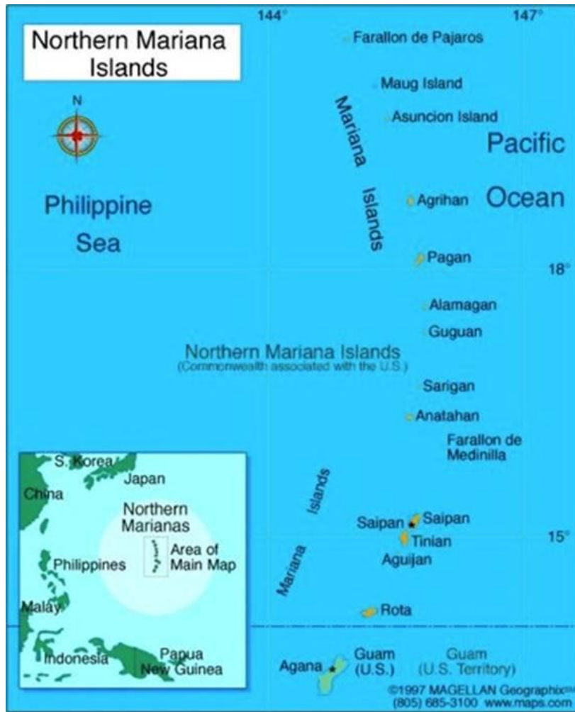
Northern Mariana – note Tinian & Saipan Islands