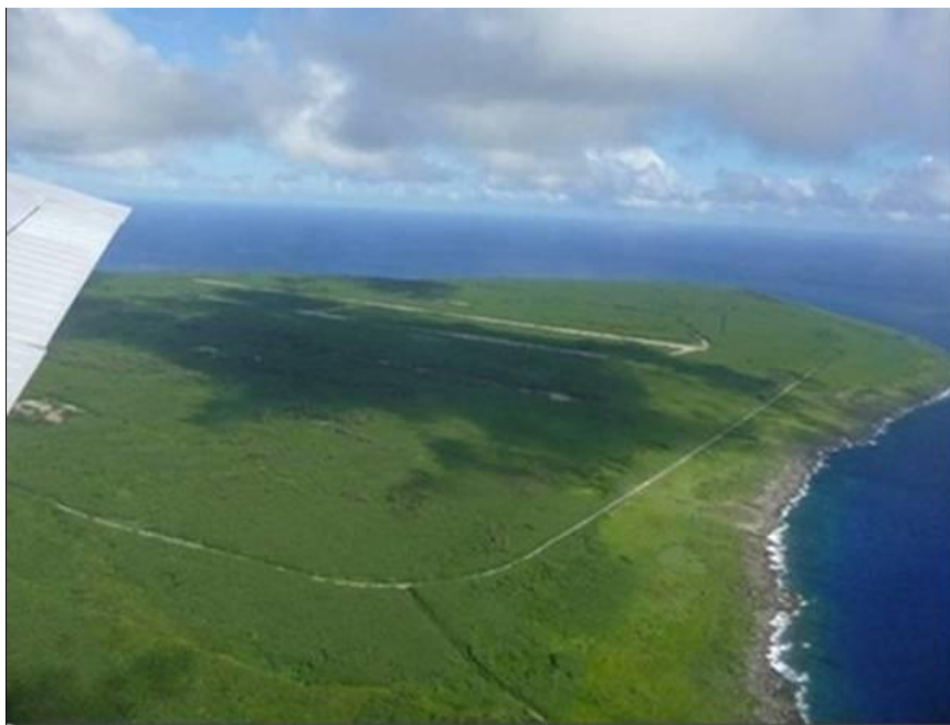
Aerial View – Runway Able