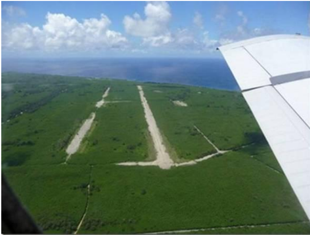
Runway Able – Tinian Island