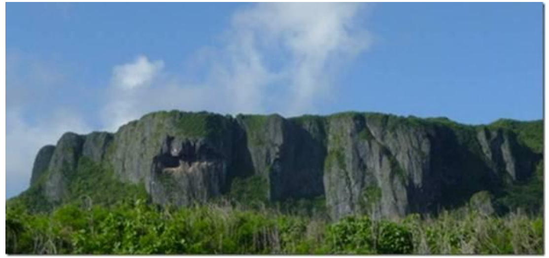
Banzai Cliff – where civilians were ordered to commit suicide rather than surrender to US troops