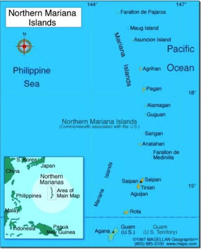
Northern Mariana – note Tinian & Saipan Islands