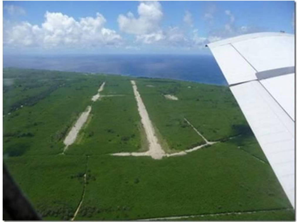
Runway Able – Tinian Island