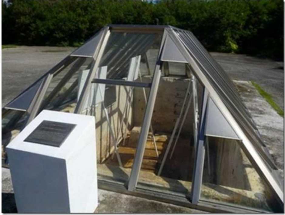
Atomic Bomb Pit #1 – Where "Little Boy" was loaded on the Enola Gay