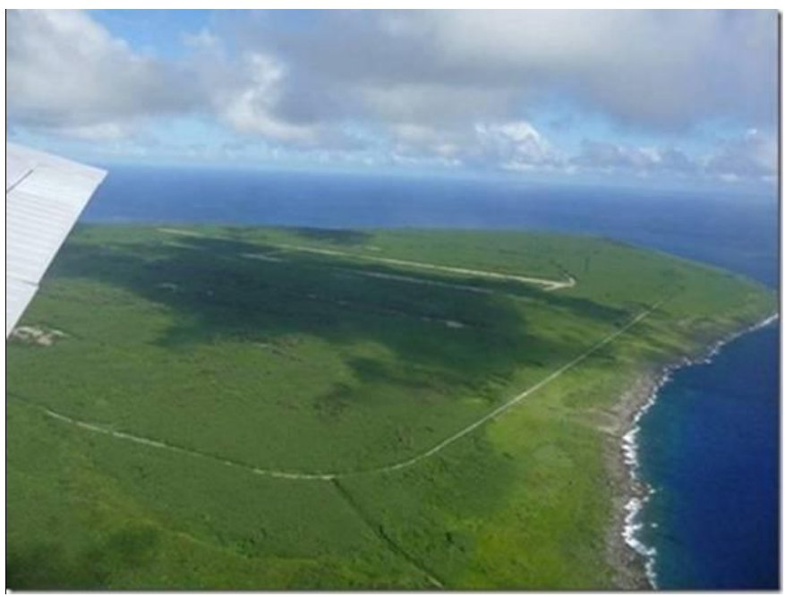
Aerial View – Runway Able